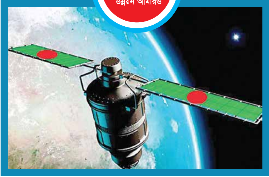
বঙ্গবন্ধু স্যাটেলাইট-১ : বাংলাদেশের মালিকানাধীন প্রথম কৃত্রিম উপগ্রহ

বঙ্গবন্ধু স্যাটেলাইট-১ বাংলাদেশের প্রথম ভূস্থির (Geostationary) যোগাযোগ ও সম্প্রচার উপগ্রহ। এর মধ্যে দিয়ে ৫৭ তম দেশ হিসেবে নিজস্ব স্যাটেলাইট উৎক্ষেপণকারী দেশের তালিকায় যুক্ত হয় বাংলাদেশ। এটি ১১ই মে ২০১৮ যুক্তরাষ্ট্রের কেনেডি স্পেস সেন্টার থেকে উৎক্ষেপণ করা হয়। এটি ছিল ফ্যালকন ৯ ব্লক-৫ রকেটের প্রথম পেলোড উৎক্ষেপণ। এটি ফ্রান্সের থেলিস অ্যালেনিয়া স্পেস কর্তৃক নকশা ও তৈরি করা হয়েছে। বঙ্গবন্ধু স্যাটেলাইট-১, ১৬০০ মেগাহার্টজ ক্ষমতাসম্পন্ন মোট ৪০টি কে-ইউ এবং সি-ব্যান্ড ট্রান্সপন্ডার বহন করছে এবং এর আয়ু ১৫ বছর। এর নির্মাণ ব্যয় প্রায় তিন হাজার কোটি টাকা। বর্তমানে স্যাটেলাইটের ব্যান্ডউইথ ও ফ্রিকোয়েন্সি ব্যবহার করে ইন্টারনেট বঞ্চিত অঞ্চল যেমন- পার্বত্য ও হাওড় এলাকায় ইন্টারনেট সুবিধা প্রদান করা সম্ভব হচ্ছে, প্রত্যন্ত অঞ্চলে ইন্টারনেট ও ব্যাংকিং সেবা, টেলিমেডিসিন ও দূরশিক্ষণ ব্যবস্থা প্রসারেও এটি ব্যবহৃত হচ্ছে। টিভি চ্যানেলগুলো তাদের সম্প্রচার সঠিকভাবে পরিচালনার জন্য বিদেশি নির্ভরতা কমিয়ে এর উপর নির্ভর করছে। ফলে দেশের টাকা দেশেই থাকছে। বড় প্রাকৃতিক দুর্ঘটনার সময় মোবাইল নেটওয়ার্ক অচল হয়ে পড়লে এর মাধ্যমে দুর্গত এলাকায় যোগাযোগ চালু রাখা সম্ভব। শুধু তাই নয় শেখ হাসিনা সরকারের বর্তমান মেয়াদেই বঙ্গবন্ধু স্যাটেলাইট-২ মহাকাশে উৎক্ষেপণেরও উদ্যোগ নেওয়া হবে। বঙ্গবন্ধু ১৯৭৫ সালের ১৪ই জুন বেতবুনিয়ায় ভূ-উপগ্রহ কেন্দ্র স্থাপনের মাধ্যমে যে স্বপ্নের বীজ বপন করেছিলেন, সেই স্বপ্ন মহীরূহে পরিণত করেছেন প্রধানমন্ত্রী শেখ হাসিনা।