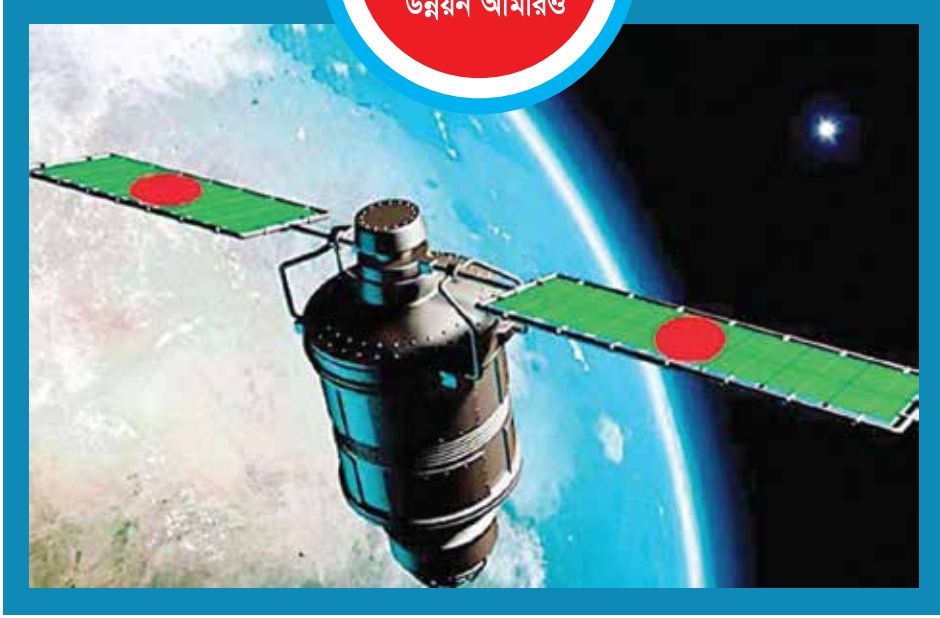
বঙ্গবন্ধু স্যাটেলাইট-১ : বাংলাদেশের মালিকানাধীন প্রথম কৃত্রিম উপগ্রহ

বঙ্গবন্ধু স্যাটেলাইট-১ বাংলাদেশের প্রথম ভূস্থির (Geostationary) যোগাযোগ ও সম্প্রচার উপগ্রহ। এর মধ্যে দিয়ে ৫৭ তম দেশ হিসেবে নিজস্ব স্যাটেলাইট উৎক্ষেপণকারী দেশের তালিকায় যুক্ত হয় বাংলাদেশ। এটি ১১ই মে ২০১৮ যুক্তরাষ্ট্রের কেনেডি স্পেস সেন্টার থেকে উৎক্ষেপণ করা হয়। এটি ছিল ফ্যালকন ৯ ব্লক-৫ রকেটের প্রথম পেলোড উৎক্ষেপণ। এটি ফ্রান্সের থেলিস অ্যালেনিয়া স্পেস কর্তৃক নকশা ও তৈরি করা হয়েছে। বঙ্গবন্ধু স্যাটেলাইট-১, ১৬০০ মেগাহার্টজ ক্ষমতাসম্পন্ন মোট ৪০টি কে-ইউ এবং সি-ব্যান্ড ট্রান্সপন্ডার বহন করছে এবং এর আয়ু ১৫ বছর। এর নির্মাণ ব্যয় প্রায় তিন হাজার কোটি টাকা। বর্তমানে স্যাটেলাইটের ব্যান্ডউইথ ও ফ্রিকোয়েন্সি ব্যবহার করে ইন্টারনেট বঞ্চিত অঞ্চল যেমন- পার্বত্য ও হাওড় এলাকায় ইন্টারনেট সুবিধা প্রদান করা সম্ভব হচ্ছে, প্রত্যন্ত অঞ্চলে ইন্টারনেট ও ব্যাংকিং সেবা, টেলিমেডিসিন ও দূরশিক্ষণ ব্যবস্থা প্রসারেও এটি ব্যবহৃত হচ্ছে। টিভি চ্যানেলগুলো তাদের সম্প্রচার সঠিকভাবে পরিচালনার জন্য বিদেশি নির্ভরতা কমিয়ে এর উপর নির্ভর করছে। ফলে দেশের টাকা দেশেই থাকছে। বড় প্রাকৃতিক দুর্যোগের সময় মোবাইল নেটওয়ার্ক অচল হয়ে পড়লে এর মাধ্যমে দুর্গত এলাকায় যোগাযোগ চালু রাখা সম্ভব। শুধু তাই নয় শেখ হাসিনা সরকারের বর্তমান মেয়াদেই বঙ্গবন্ধু স্যাটেলাইট-২ মহাকাশে উৎক্ষেপণেরও উদ্যোগ নেওয়া হবে। বঙ্গবন্ধু ১৯৭৫ সালের ১৪ই জুন বেতবুনিয়ায় ভূ-উপগ্রহ কেন্দ্র স্থাপনের মাধ্যমে যে স্বপ্নের বীজ বপন করেছিলেন, সেই স্বপ্ন মহীরুহে পরিণত করেছেন প্রধানমন্ত্রী শেখ হাসিনা।